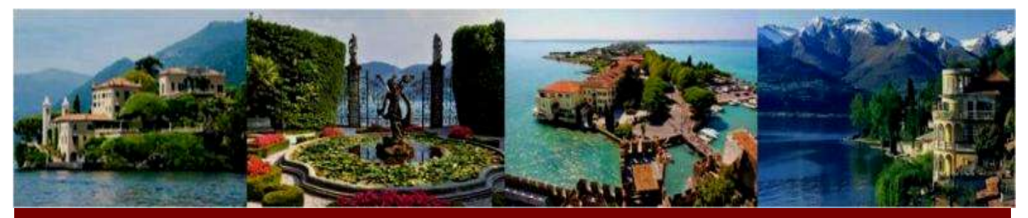
Milan – Lage Maggiore – Borromean islands – Lake Como – Lake Garda – Verona