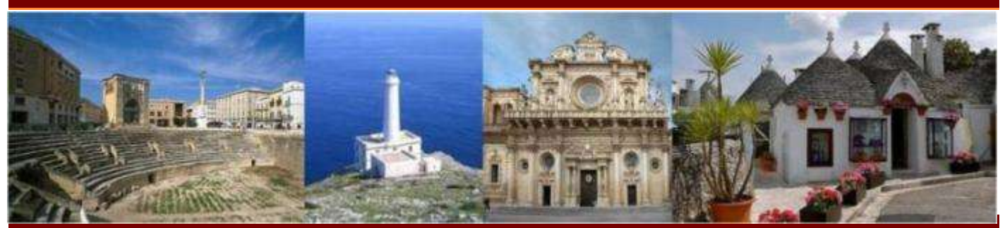
Bari – Matera – Valle D'Itria – Alberobello – Lecce – Otranto – Salento Peninsula – Bari